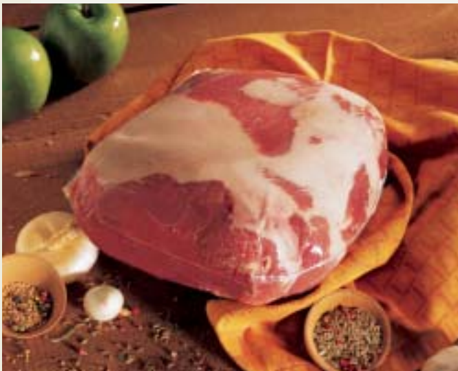
SQUARE CUT PORK BUTT

AVAILABLE IN A VARIETY OF PORTION SIZES. Many different cuts of butts and picnics may be available in-the-bag depending on supplier. Square cut butts, pork blades, country style ribs, pork steaks, center cut picnics, extra meaty pork hocks, and more.