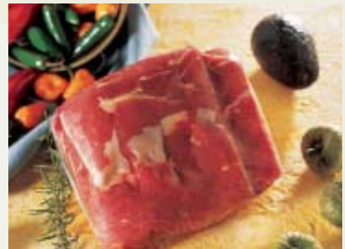
FAMILY PACK PORK BLADE COUNTRY STYLE RIBS

100 Rogers Bridge Road, Bldg. A Duncan, SC 29334-0464 Tel: 800.845.3456 Fax: 864.433.2134 www.cryovac.com