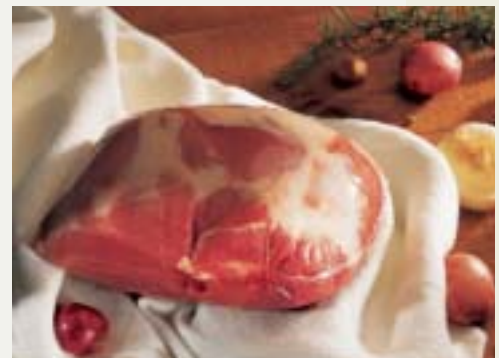
PORK PICNIC ROAST CENTER CUT