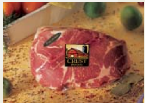
FAMILY PACK PORK STEAKS