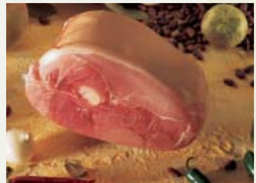
EXTRA MEATY PORK HOCK