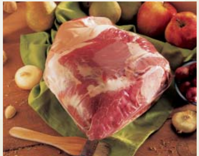
WHOLE PORK PICNIC